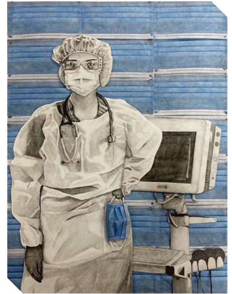
Last Line by Clare Knox

In addition to the shows named above, FHS artists also had work displayed at the Museum of Contemporary Art Detroit (MOCAD); MAEA - Region 6 Show; MAEA - Top 100 Show; Governor's Traveling Show;